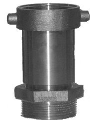
Figure No. 3370

OPTIONAL: Figure 3370 - 2 1/2 available Male X Female for use with existing FE X MA thread Angle Valve.