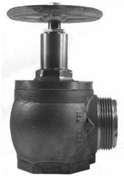
Figure No. 5760

STANDARD EQUIPMENT: Female NPT inlet X Male hose thread outlet cast brass valve with wheel handle.