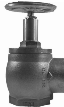
Figure No. 5765

STANDARD EQUIPMENT: Female NPT inlet and outlet cast brass valve with wheel handle.