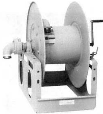
Figure No. 7091-7102