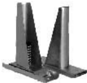
Figure No. 7090

STANDARD EQUIPMENT: All aluminum alloy or cadmium plated steel. Two piece design with bottom retainer and spring loaded top retainer.