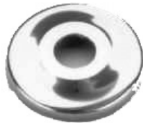
Figure No. 8050

Brass chrome plated ceiling plates designed to conceal sprinkler drops - SPECIFY SIZE