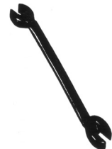
Figure No.8030 Steel Wrench For Installation of Above Heads