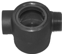
Figure No. 8062-8064

Used to provide visual observation of water discharge from a sprinkler system drain. Female IPS inlet and outlet with two sight windows.