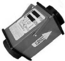
Figure No. 8096