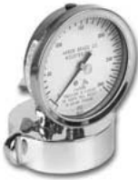
Cap type with Petcock

Figure No. 8090 1 1/2" Size 8091 2 1/2" Size