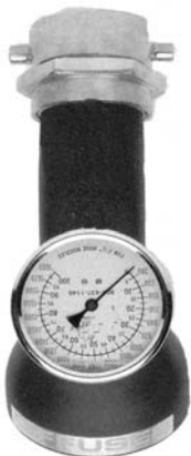
Figure No. 8098