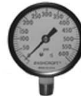
Figure No. 8089