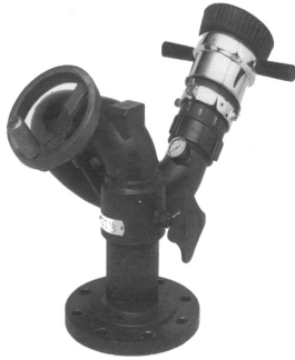
Figure No. 9012