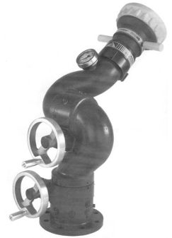
Figure No. 9013

STANDARD EQUIPMENT: Handwheel driven worm gear fully enclosed and protected from the elements. Stainless steel worm. Full 360 degree rotation. NOZZLE NOT INCLUDED. SEE PAGE 9-6.