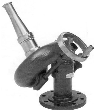
Figure No. 9031 FM Approved