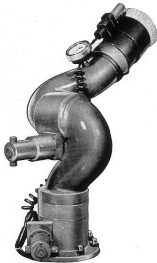
Figure No. 9040